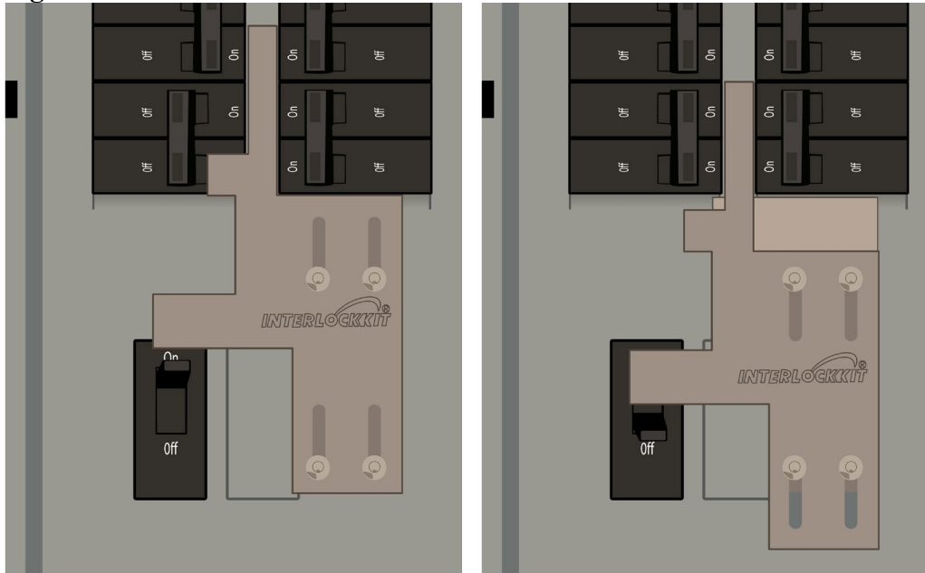
Main Breaker ON