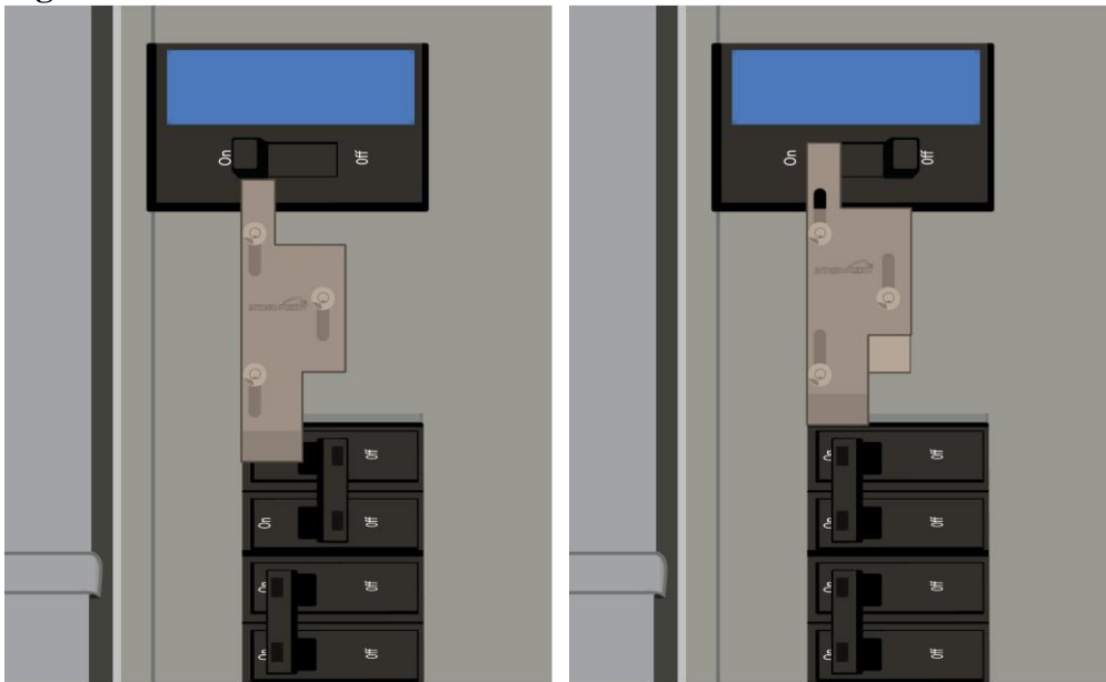
Main Breaker ON