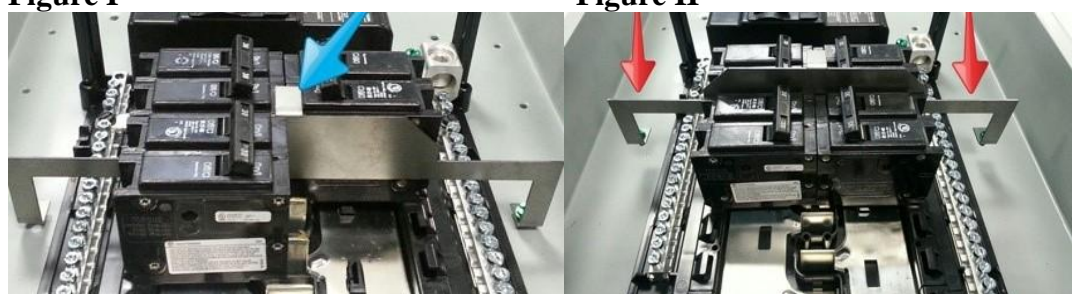
Figure I Figure II